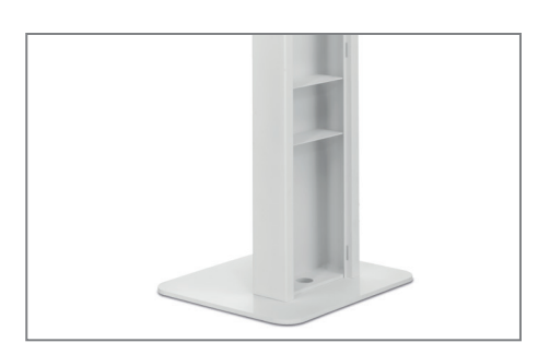
removable column cover, space for peripherals