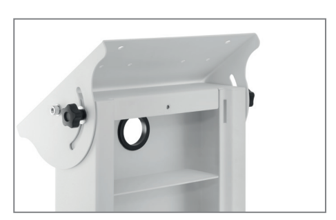
adjustable inclination, 0 - 90°

As standard, the surface of the vis-it Tilt 22 - 43" White is finished with an impact and scratch resistant powdercoating in white. Other RAL colours are possible on request.